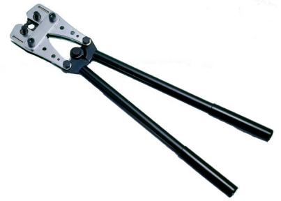
Heavy duty hexagonal crimping tool for copper tube terminals with dial type head adjustment