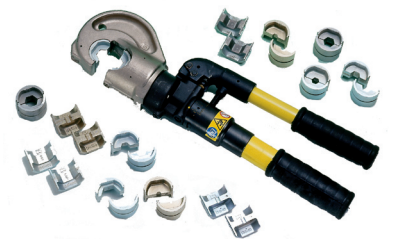
Hand hydraulic crimping tool with dies and polycarbonate carrying case for hexagonal compression of copper tube terminals