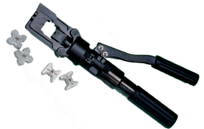
Hand hydraulic crimping tool with dies and steel case for hexagonal compression of copper tube terminals